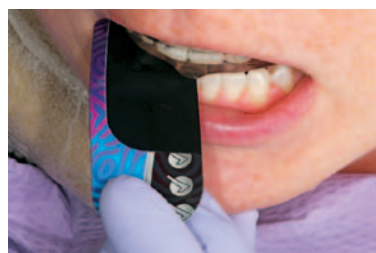
▲ Fig. 2 Regular monitoring of occlusal appliances helps avoid alteration of tooth/restorative anatomy and keep muscles relaxed. This is made more convenient using Bite-Chek. Very simply: Dry the opposing surface, position the film on the teeth facing the center of the mouth and mark the occlusion.