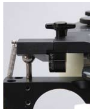
Adjust condylar inclination with convenient thumbscrew