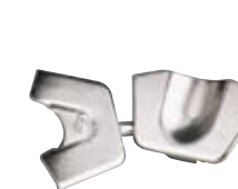
Central Bearing Clutch