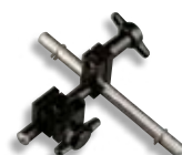
Shaft Assembly Item: 200016-1