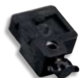
Articulator Index Item: 200080

1 Hanau™ Jig and maxillary cast support — Item: 20009833