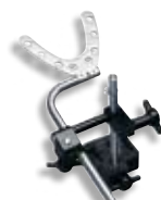
Complete Transfer Jig Assembly Item: 200009-1