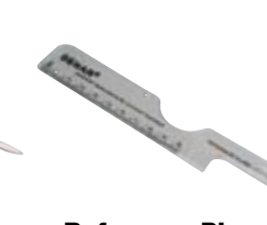
Reference Plane Locator