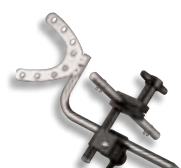
Bitefork/Shaft Assembly Item: 200007