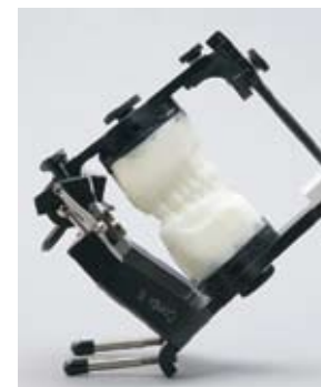
Tilts back at 45° angle, allowing you to view the casts as if the patient were there