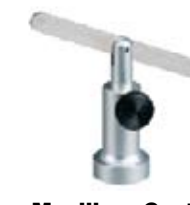
Maxillary Cast Support