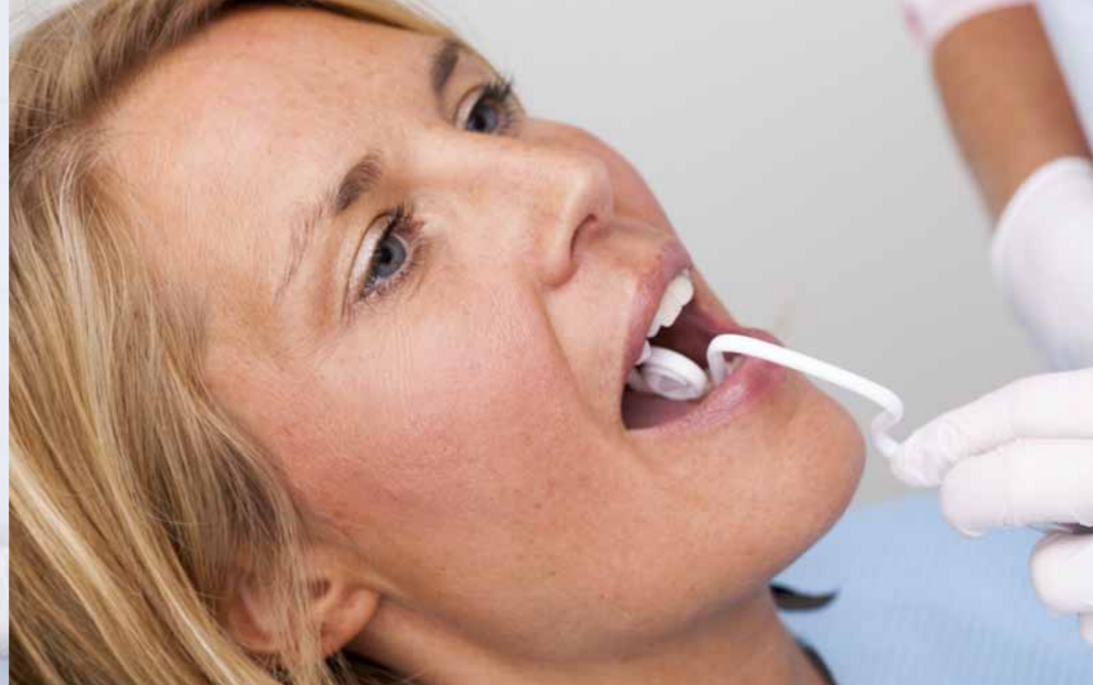
The Hygoformic saliva ejector should stay in place without hurting. If the patient experiences discomfort, the Hygoformic saliva ejector should be loosened.