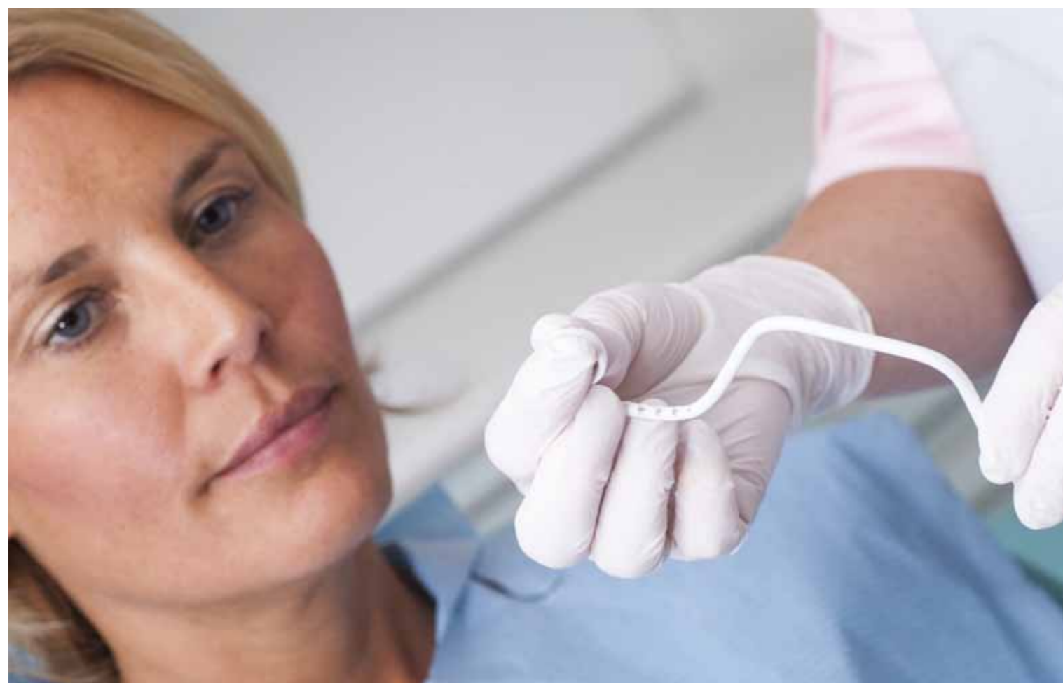
Stretch the Hygoformic saliva ejector to suit the patient's anatomy. The saliva ejector has a memory and can be stretched and bent to suitable shape.