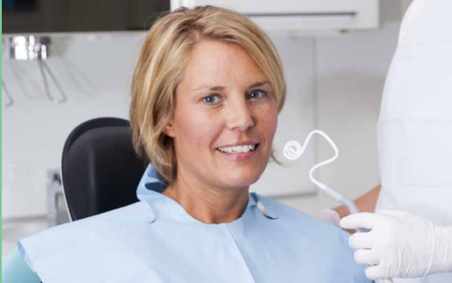
Insert an Hygoformic saliva ejector into standard ejection system. Use a suitable adaptor for Hygoformic if necessary.